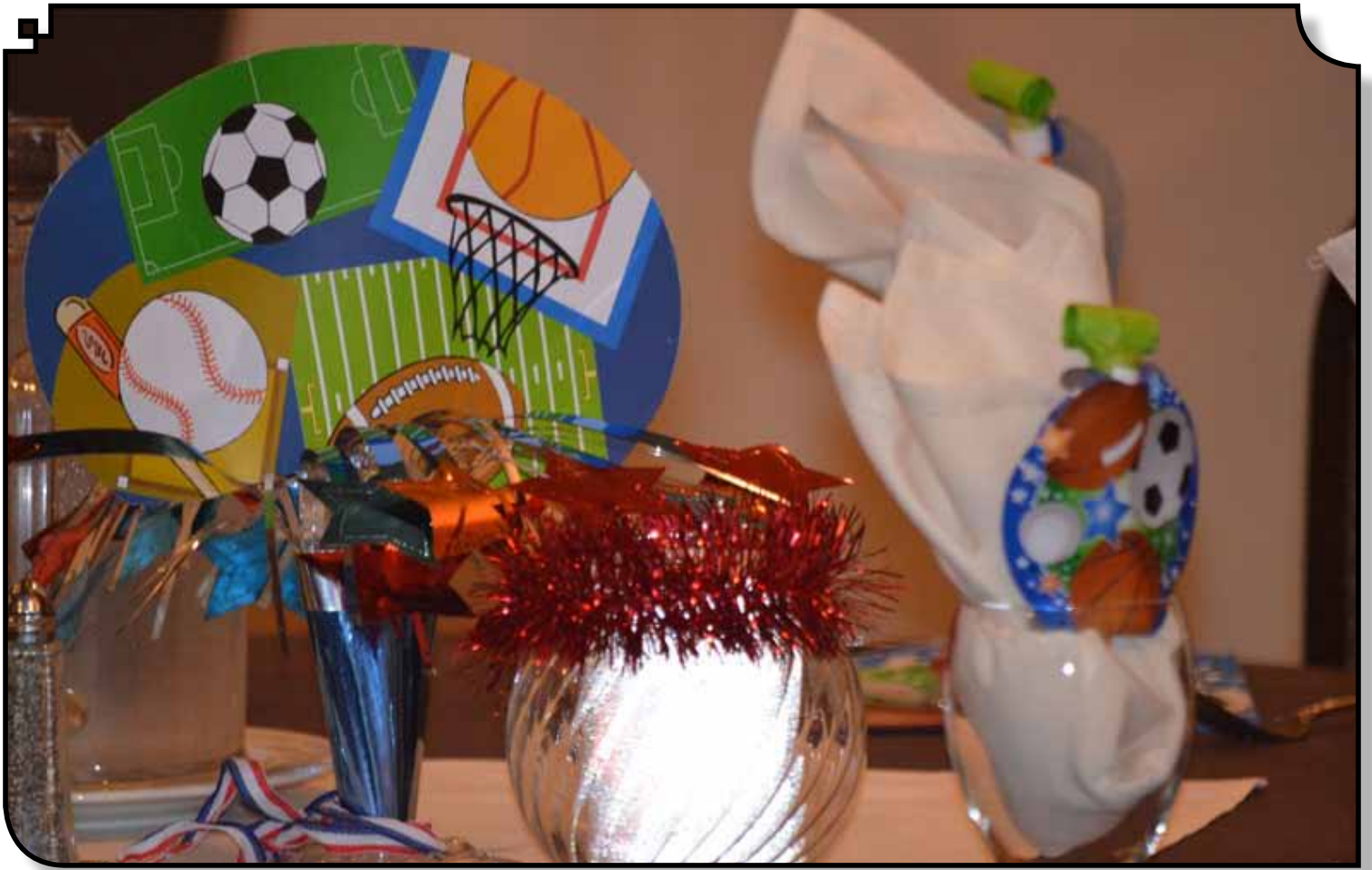
BMWRO Annual Beach Bash — Table Decorations: Sports Theme