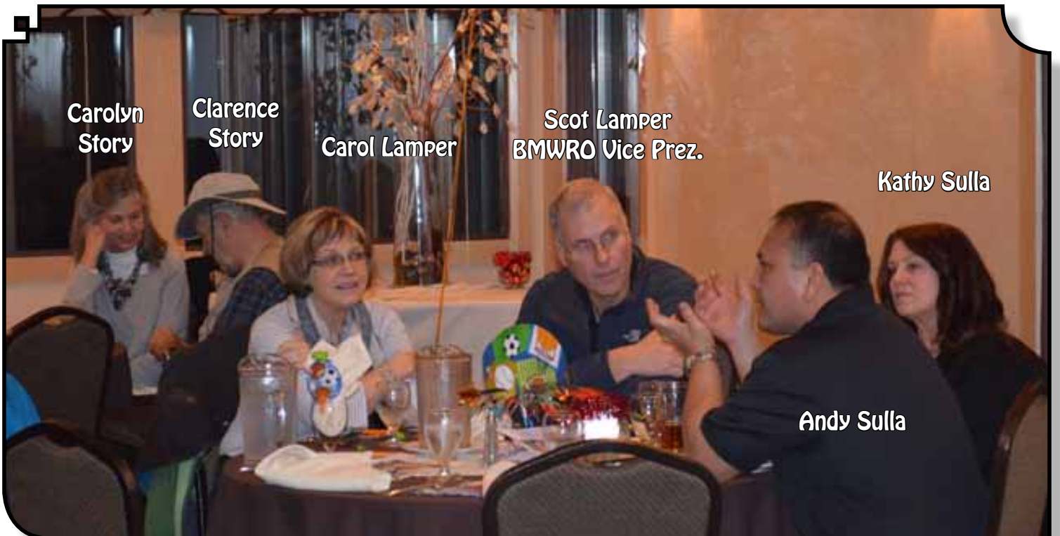
BMWRO Annual Beach Bash — The Usual Suspects attend