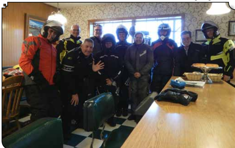
Ten well-fed riders smile for the camera before a soggy ride home.