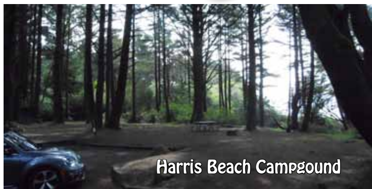
Harris Beach Campground