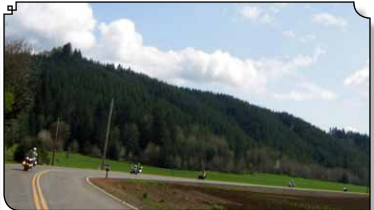
Sweeping Through Lewis County, WA