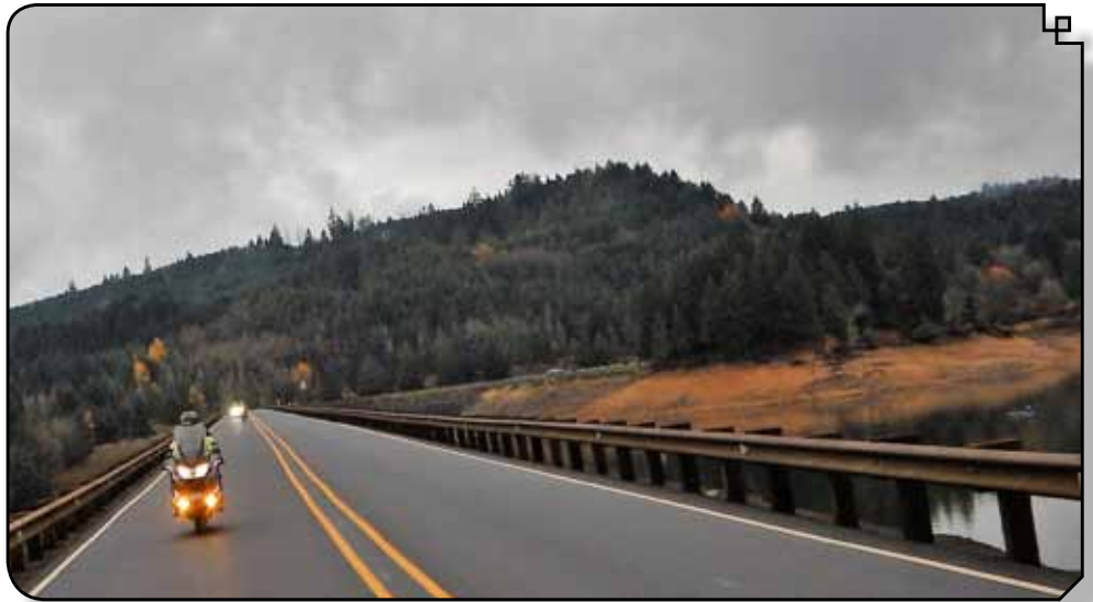
Crossing Hagg Lake. We definitely could use some rain.

Cold-weather rides require us to keep shade and elevation in mind. So we tend to stay on the valley floor, where the sun can get to most of the roads. That still gives