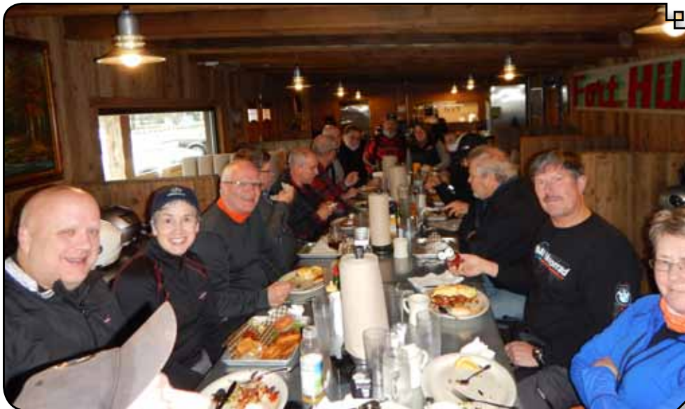
A hungry horde dominates the Fort Hill Public House.

Just when we tightened our loins for another long segment, we