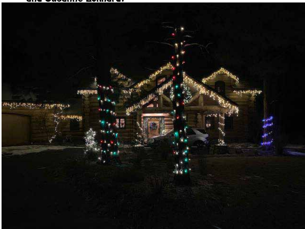
the Cesafsky home