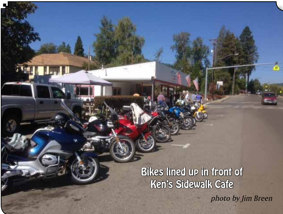
Bikes lined up in front of Ken's Sidewalk Cafe