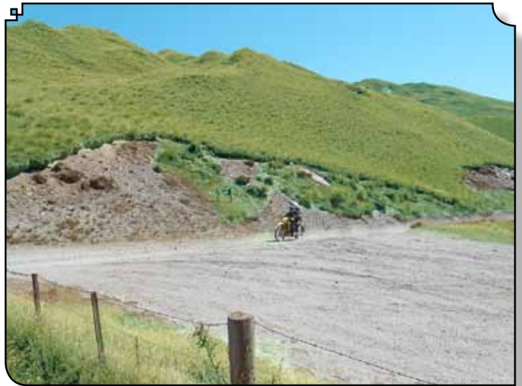
Off-Road Riding in New Zealand

Event: Seattle Motorcycle Show Date/Time: November 21st – 23rd, 2014 Place: Seattle Washington Description: http://www.motorcycleshows.com/detail Contact: