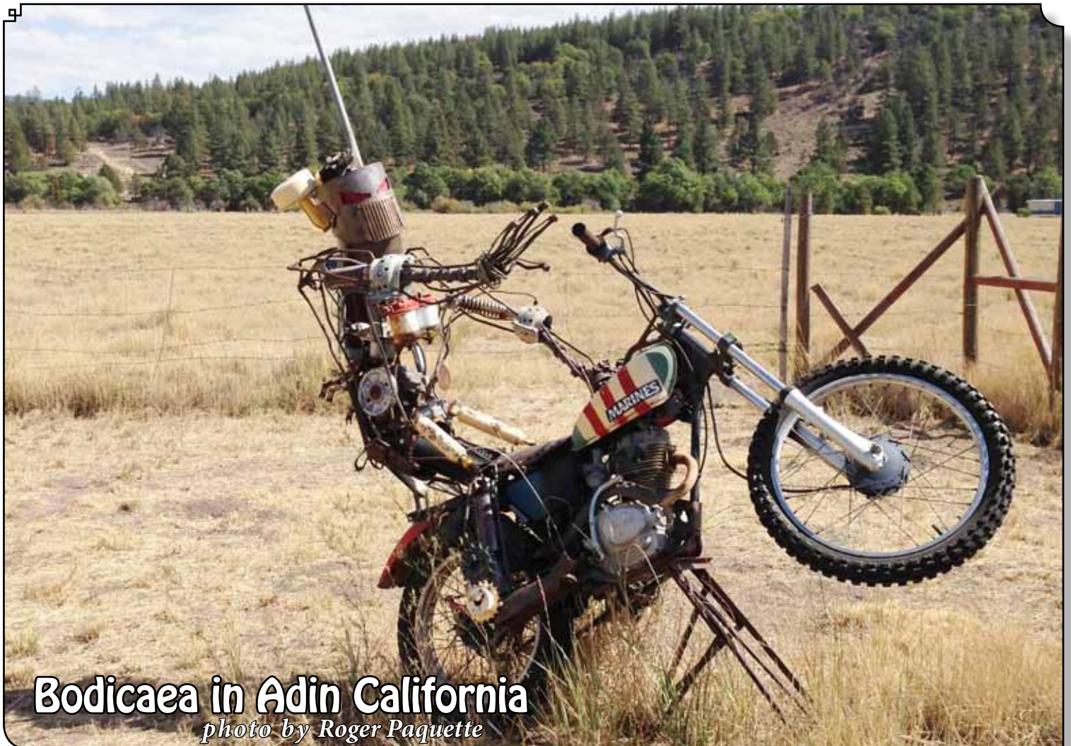
Bodicaea in Adin California