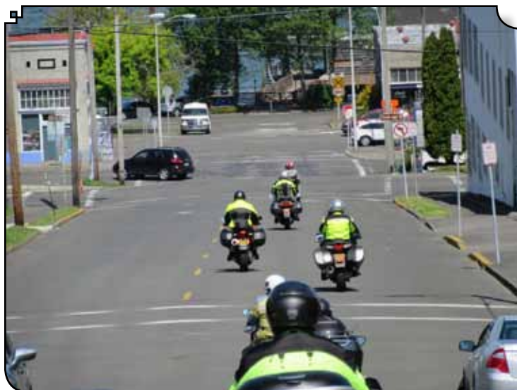
After lunch in Astoria, back on the road...

A few peeled off after lunch, leaving 15 of us to cross the Astoria Bridge into Washington. Unusual diversions on the Washington side ride back included South Valley Road near Naselle, the Barr Loop Road