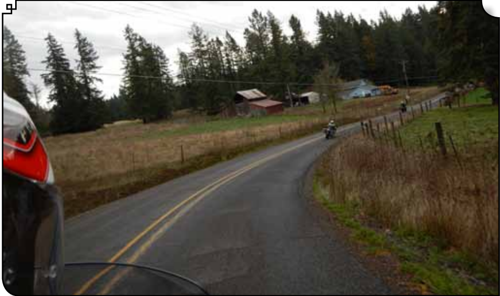
Cornering in Marion County

One of the real treats that come from our monthly rides is introducing folks who think they