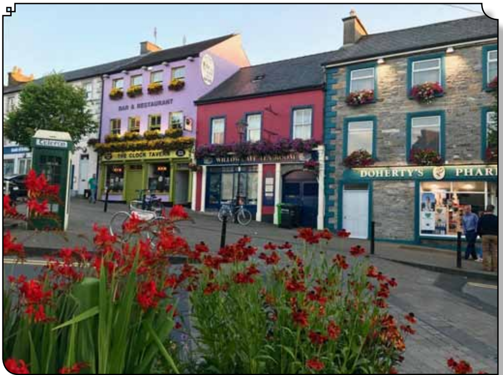
Architecture In Westport Town

The Ring of Kerry (red loop) closely follows the Atlantic coast for 90% of the ride. This road is not recommend for the fainthearted.