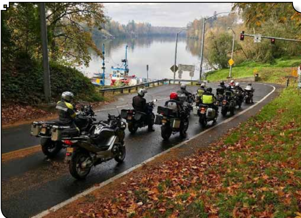
Queuing for the Canby ferry...