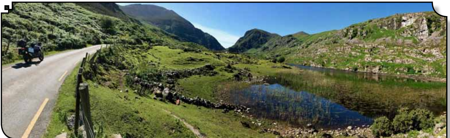
The Gap Of Dunloe