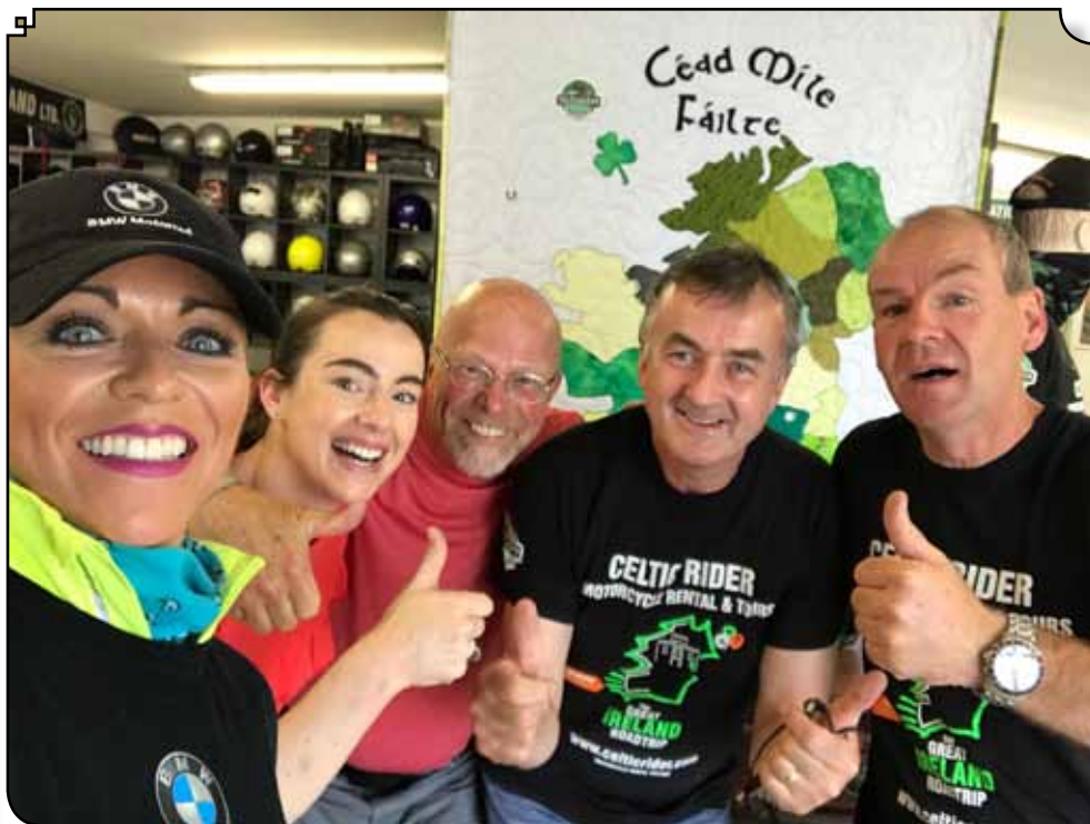
The Celtic Rider Crew

possible. So, I am going to go with several old adages. Brief is better. Pictures and smiles say 1000 words.