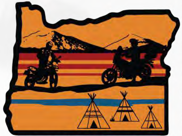
CHIEF JOSEPH RALLY 📅 JUNE 2020 BMW Riders of Oregon